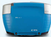
Multi-Angle Color & Effect BYK-mac i